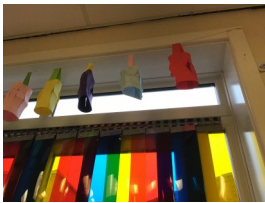
(A: Year of the Rat)

RECEPTION'S learning this week has been about Chinese New Year. These are some of many DRAGONS and Lanterns made this week. Which animal's year is it?