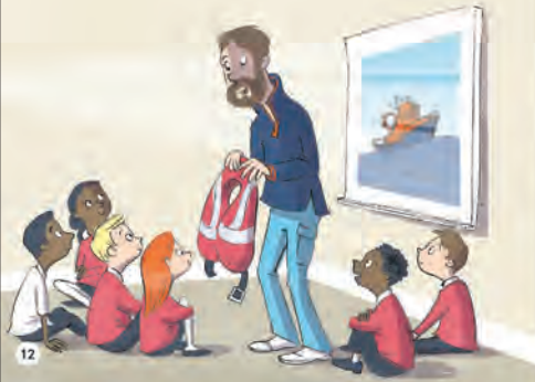
The lifeboat crew, Set 7 Grey