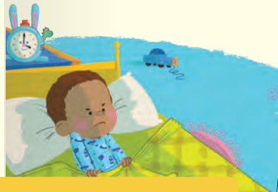
Beth's chip shop, Set 1 Green